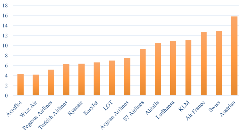
Figure 2. Age of European fleet

GAU, UR-GAW 23-25 years old ). Excluding the cargo Boeing 737-300, the average age of the UIA fleet is 12,6 years.