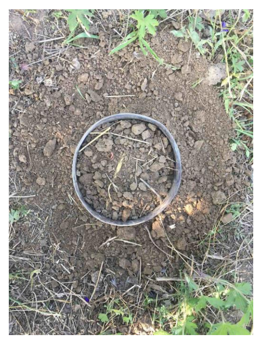
Fig 2.22 Incubator containers

5. Filling containers: the containers were completely filled with soil, leaving about 5 centimeters of free space up to the edges.