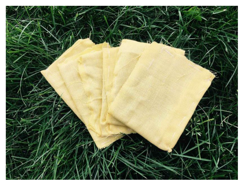
Fig 2.20 Envelopes 10 cm * 15 cm

2. Preparation of incubator containers: five 5 l containers were filled with soil and placed into the soil so, that the top part is located at the level of the ground.