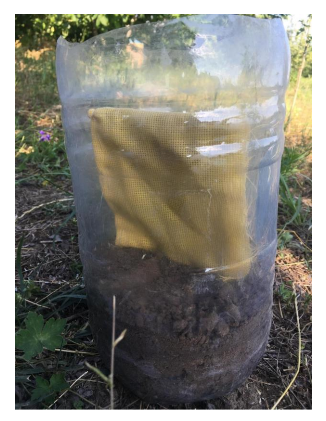
Fig 2.21 Incubator containers

3. Sampling of soil: samples of soil were taken while digging the holes for incubation containers with minimal damage to the soil structure.