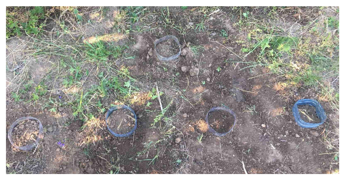
Fig 2.23 Incubator containers in soil

7. Addition of pollutants: the prepared pollutants solutions were uniformly distributed over the soil surface in each container – one type of pollutant per container.