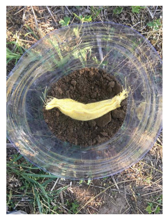
Fig 2.21 Incubator containers

5. Filling containers: the containers were completely filled with soil, leaving about 5 centimeters of free space up to the edges.