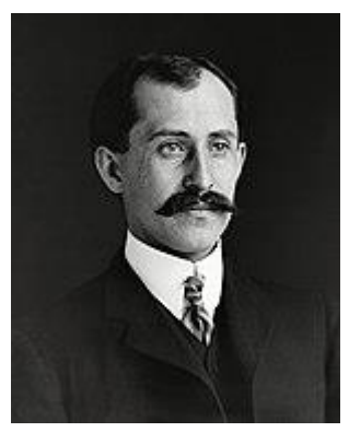
Text 2. The Wright brothers