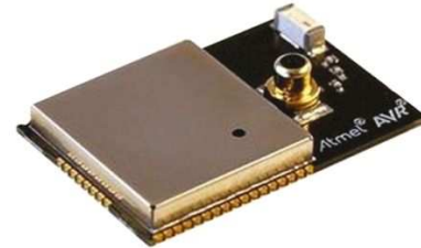
Fig. 2. ATZB-S1-256-3-0-C Radiounit.

complete radiounits produced by Atmel company (which was recently acquired by Microchip). For example, complete radiounit ATZB-S1-256-3-0-C is a completely finished and ready-to-use solution, with an integrated antenna, transceiver and a powerful microcontroller. The module has a small size, costs about $ 20 and only needs an installation of the module to the base pla for the power supply and easy IO ports access. Solutions with a radio signal amplifier are also available, which allows extending the range of the antenna (Fig. 2).