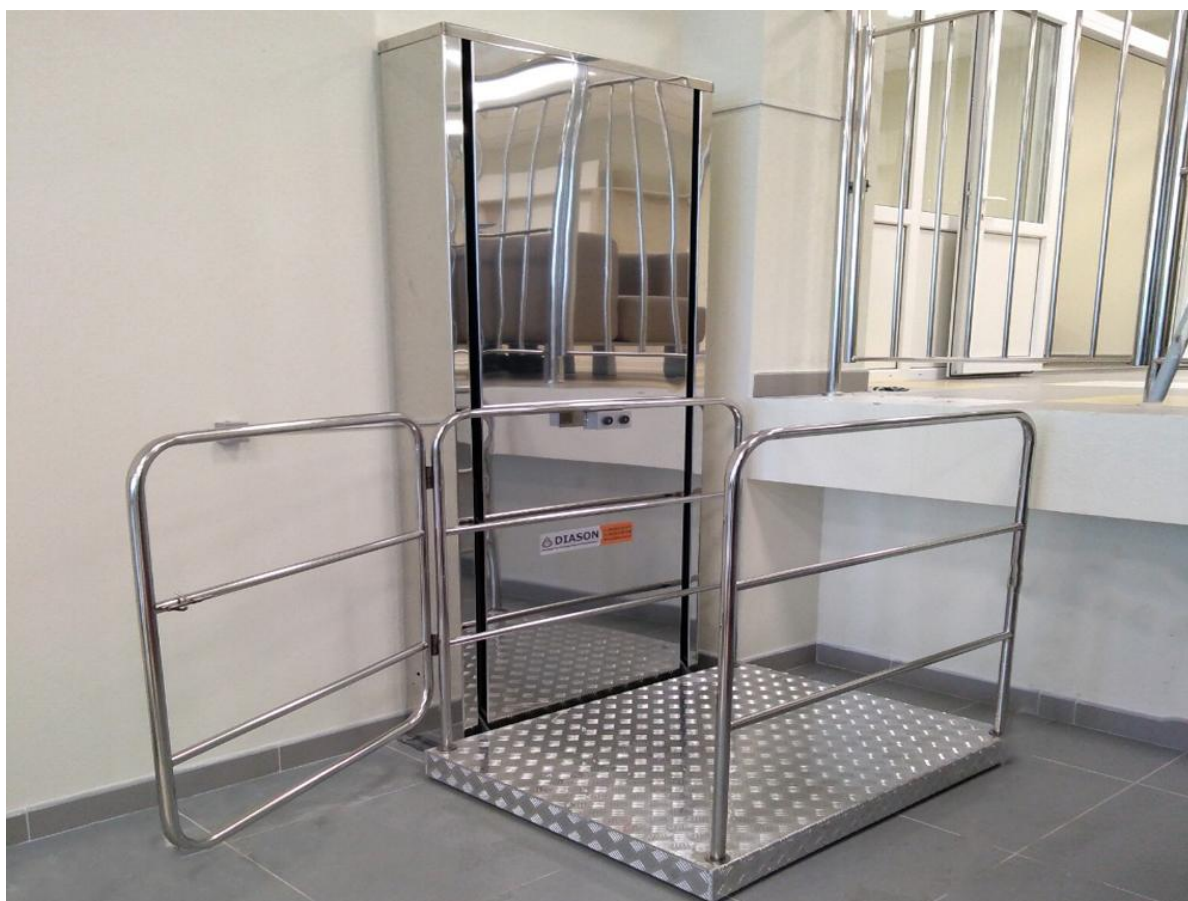
Fig. 2.2. Disabled vertical lift.

The safety of the hoist is ensured by limit switches that limit platform movements at the top and bottom points and the corrugated non-slip surface of the platform. It should be noted the possibility of installing a special module that stops the movement of the platform if foreign objects fall under the platform. You can also install a system of mechanical platform lowering on such a lift when the power supply is cut off. This model is often used in places where it is possible to install and fix the rack rail to the wall or to the ceiling. To form a pit 100 mm deep, it is possible to ensure the level of the platform is flush with the floor. The ramp is most often used (stationary or fixed on a platform).