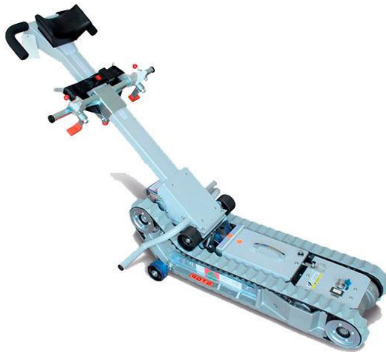
Fig. 2.4. The electric mobile crawler hoist.

compact collapsible design, such a lift can be easily transported in a car and used both indoors and outdoors.