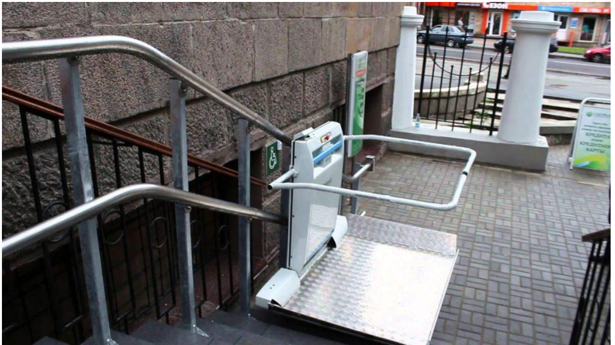
Fig. 2.1. Vertical lift.

Vertical lifts are stationary devices similar to a normal lift, they allow people in wheelchairs to climb and descend, overcoming level differences and flights of stairs. A vertical lift for disabled people is the most common type of specialized mechanisms in the form of a console platform (fig. 2.1). Designed for lifting / lowering people with disabilities in a vertical plane with maximum comfort and safety.