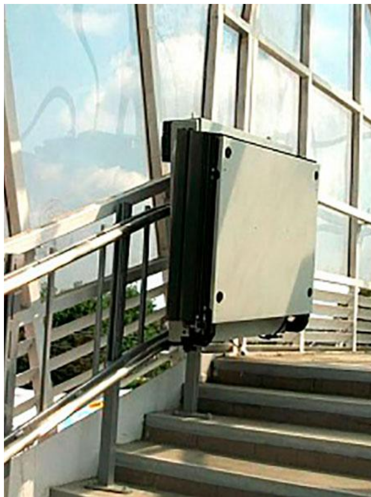
Fig. 2.3. Inclined lifting platform.

An inclined lifting platform is installed against the wall at the entrance to the staircase and helps the disabled to climb to the desired floor (fig. 2.3). The inclined stair lift is a stationary device that is installed in homes and public buildings. In places where it is not possible to install a stationary lift, as a rule, tracked or walking step walkers are used.