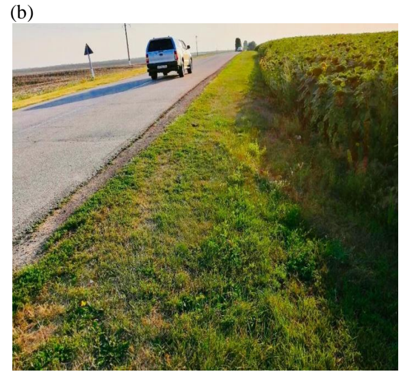
Figure 1. Use of the wayside: a - Odessa region, b - Kiev region.

The picture demonstrates that the adjacent lands are seeded just next to the easement areas of motorways. There is an enormous quantity of such examples. Neither the proprietors, not the leaseholders meet the respective rules. This causes contamination of the agricultural plants with heavy metals; a domino effect brings them to human bodies in a daily food, like bread, oil, butter, eggs, meat, and others. Low quality of food thus leads to many severe diseases. The occurrence of the diseases and distribution thereof are determined by environmental and social-economic factors. Their importance grows steadily due to the way of life, level of income, housing conditions, and structure of nutrition.