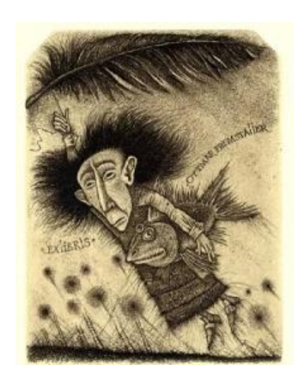
Figure 4

manner of realizing stylized images (Figure 4: Ex libris O. Premstaller . Etching, 1995).