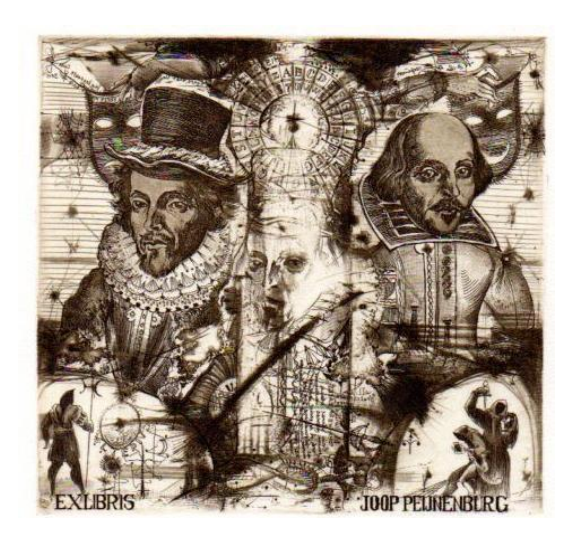
Figure 5 (From personal collection)

In a close stylistic manner, is the creative pattern of S. Ivanov. One of the great artists of Ukraine, S. Ivanov is known as a painter, as well as the creator of easel graphic, book illustration and ex libris . In the field of graphic, his sheets of work are monochrome, using the gradations of tone in a rich palette as a tool of artistic expression (Figure 5: S.Ivanov, Ex libris J. Peijnenburg . Etching, 1994).