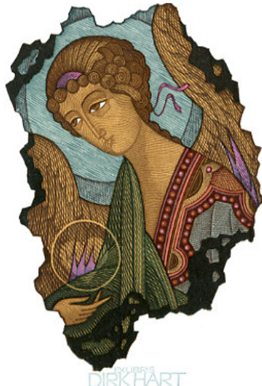
» Figure 6: Pugachevsky G. EL Dirk Hart. X6/6. 1995