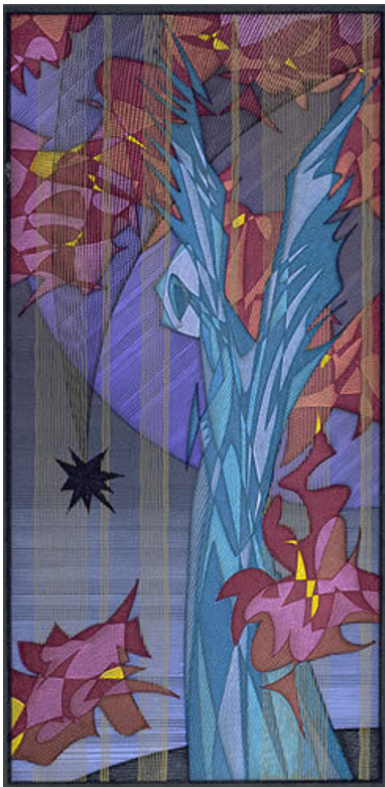
» Figure 5: Pugachevsky G. "Grief of blue Angel". X6. 1999