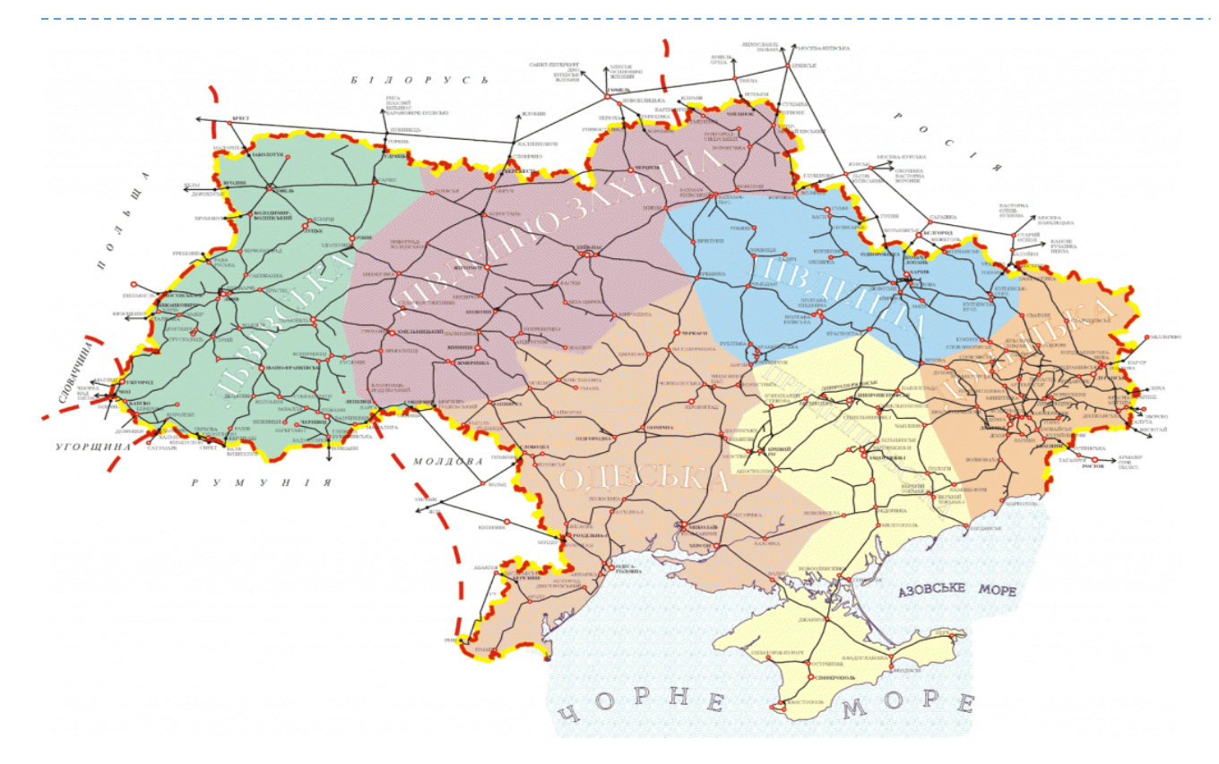
Figure 1 – Railway road map of Ukraine

As to the railway transportation, for accurate understanding the dynamics, the Table 3 is provided bellow.